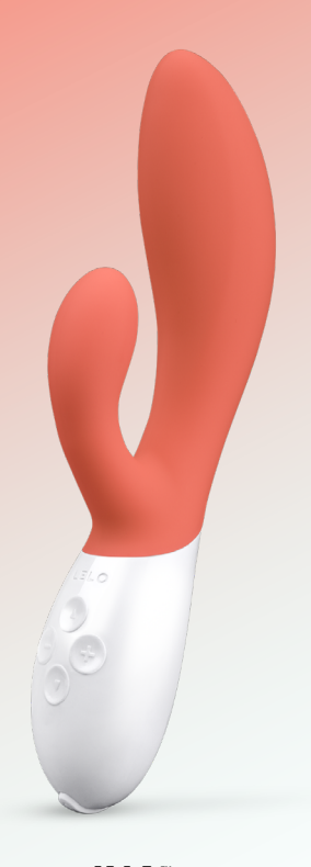
INA<sup>™</sup> 3 USER MANUAL